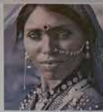
The Bhaibi Tribe

The Angami tribe is one of the major tribes of the North East India. They are known for their traditional headhunting practices and their unique culture. They are also known for their traditional weaving and their traditional music and dance. They are also known for their traditional architecture and their traditional art and craft. They are also known for their traditional medicine and their traditional knowledge of the forest and the mountains.