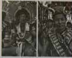
The Angami Tribe

The Angami tribe is one of the major tribes of the North East India. They are known for their traditional headhunting practices and their unique culture. They are also known for their traditional weaving and their traditional music and dance. They are also known for their traditional architecture and their traditional art and craft. They are also known for their traditional medicine and their traditional knowledge of the forest and the mountains.