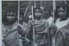
The Munda Tribe

The Kodava tribe is one of the major tribes of the North East India. They are known for their traditional headhunting practices and their unique culture. They are also known for their traditional weaving and their traditional music and dance. They are also known for their traditional architecture and their traditional art and craft. They are also known for their traditional medicine and their traditional knowledge of the forest and the mountains.