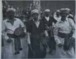
The Kodava Tribe

The Bhaibi tribe is one of the major tribes of the North East India. They are known for their traditional headhunting practices and their unique culture. They are also known for their traditional weaving and their traditional music and dance. They are also known for their traditional architecture and their traditional art and craft. They are also known for their traditional medicine and their traditional knowledge of the forest and the mountains.